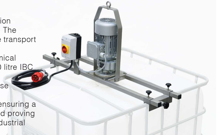
The GMEC150.1 container stirrer, shown above with the optional motor protection switch and the crane lash

In preparation for further processing or to reverse sedimentation after transport, the easy-to-use and robust SMEC container stirrers have been ensuring a constant product quality for our customers and proving their worth and flexibility year in, year out, in industrial environments.