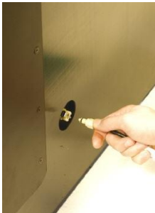
SO 2 gas inlet