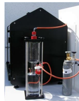
Front and side view of the glass cylinder for the manual gas dosing unit DosiCORR® MD