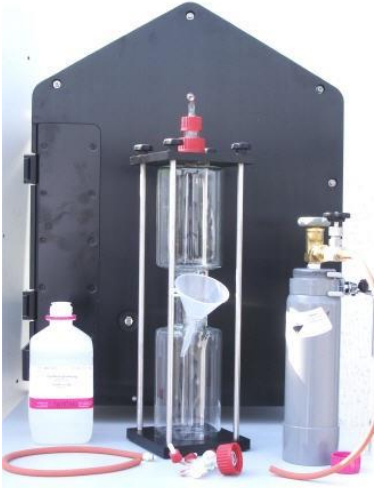
DosiCORR® MD accessories