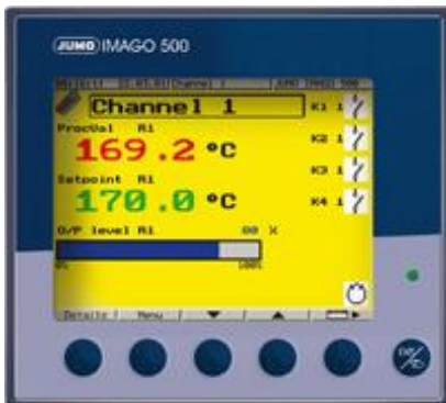
Figure 2 Jumo Imago