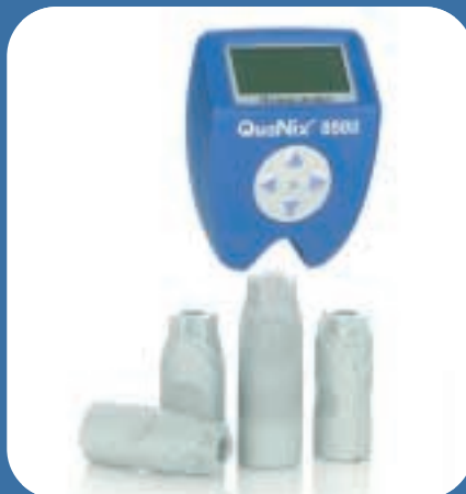
Exchangeable Fe, NFe and dual probes