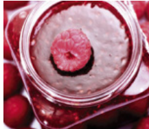
Food / Beverage